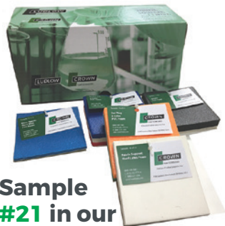
Sample #21 in our Box